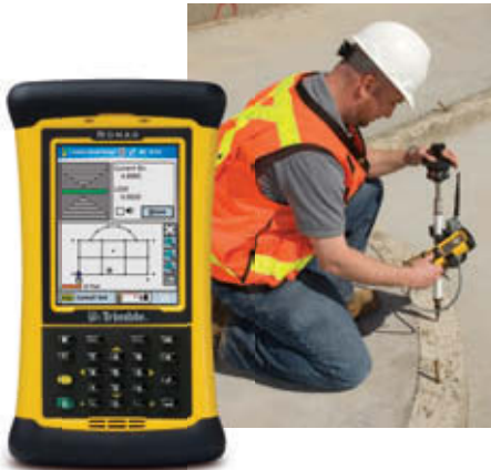
Nomad LM80-80 Layout Manager

The RTS555/633/655 Robotic Total Stations are designed specifically for the construction market and offer easy, one-person operation for all your layout needs.